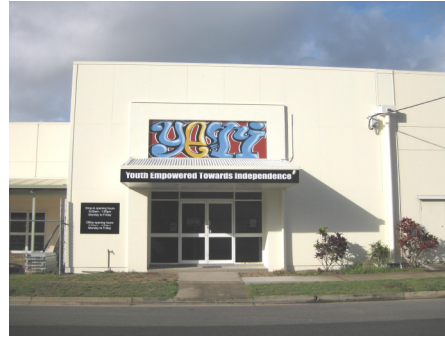
YOUTH EMPOWERED TOWARDS INDEPENDENCE

YETI receives funding from the Commonwealth Dept of Health and Ageing, the Qld Dept of Communities and from Queensland Health.